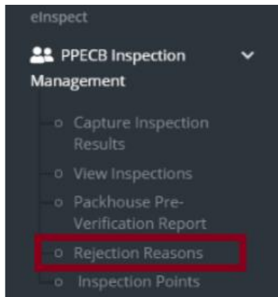
Figure 1: Rejection Reasons

2.3 Click on Create New to add rejection reasons.