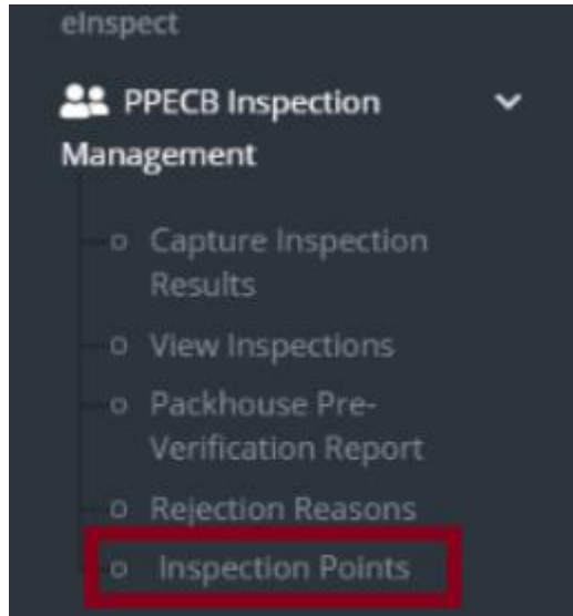
Figure 4: Inspection Points

3.2 Click on Create New to add an inspection point.