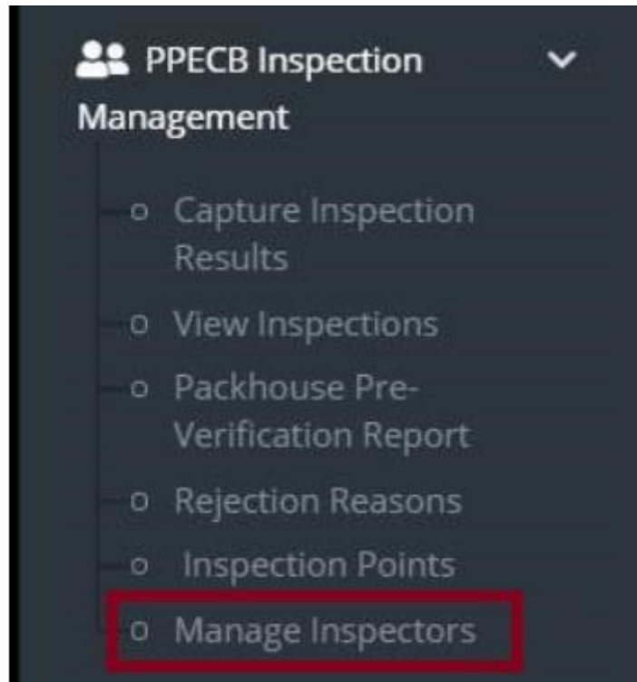
Figure 6: Manage Inspectors